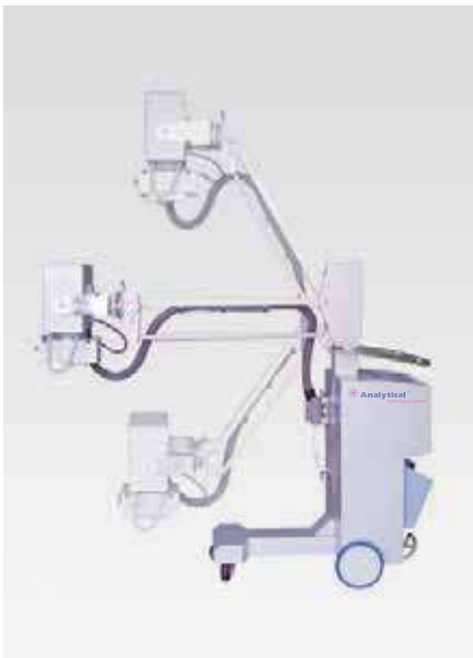
Rocker can move up and down, automatically balance