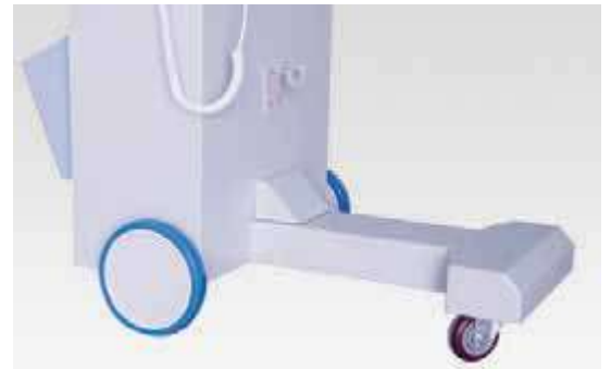
The flexible movement of the unit thanks to main wheel and direction wheel design.