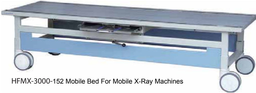
HFMX-3000-152 Mobile Bed For Mobile X-Ray Machines