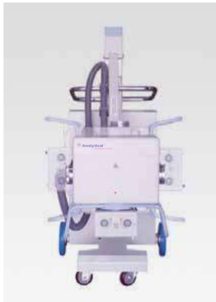
High quality X-ray monoblock can rotate in \pm 90^\circ