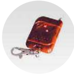
Remote hand-held controller (available in 20 meters)