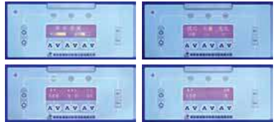
Compact operation panel, intuitive interface, easy to operate.