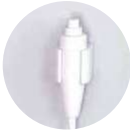
Two gears exposure hand brake